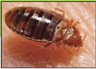
Bed bug on human skin