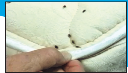
Blood spots, bed bugs, and cast skins may be found on the mattress seam.