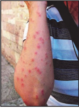
Bed bug bites on a woman's arm